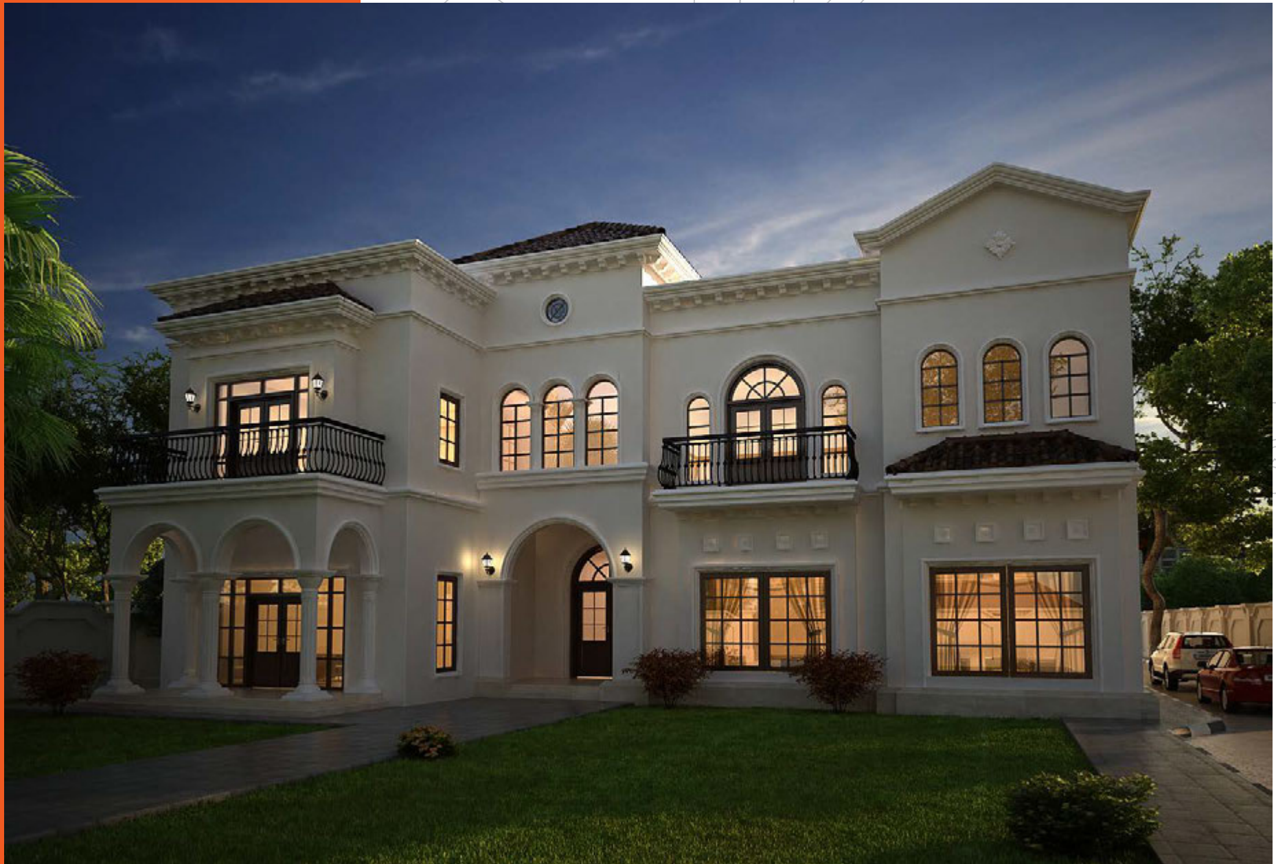
G+1 villas on plot no: 263-397 at Al Mizhar