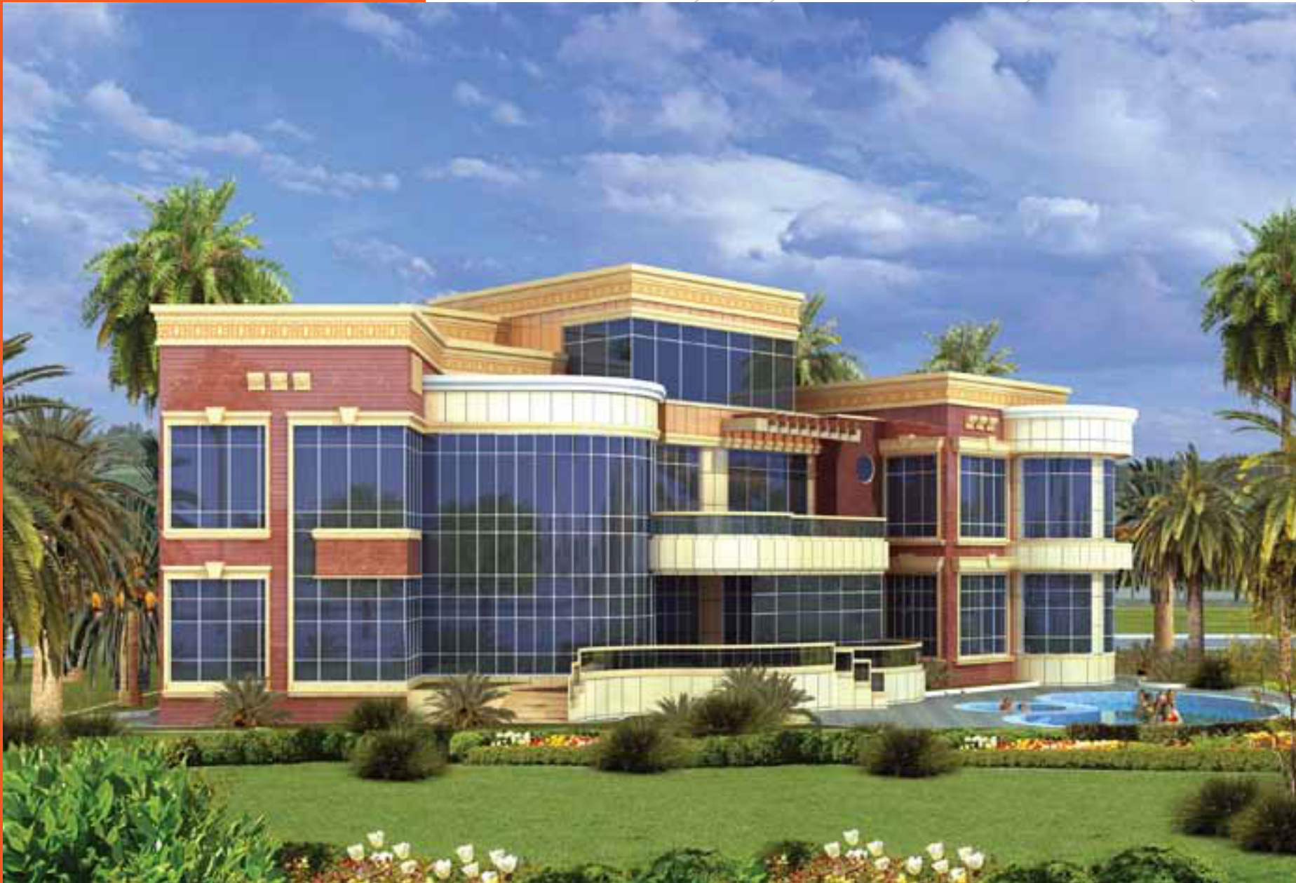
B + G + 1 villa on plot No. 134-975 at Al Mamzer