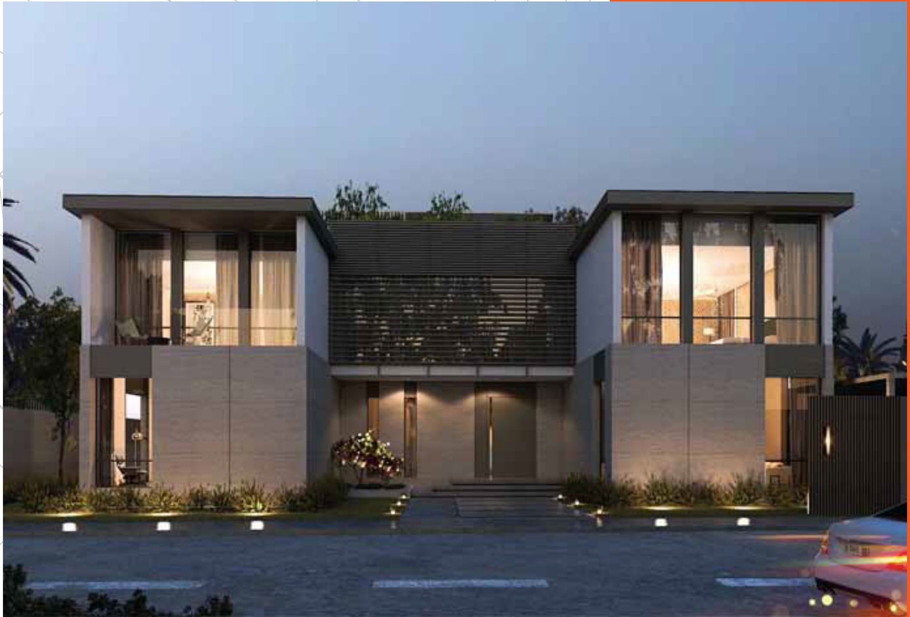
B+G+1+R Villa on plot No. 332-2914 At Jumeirah First