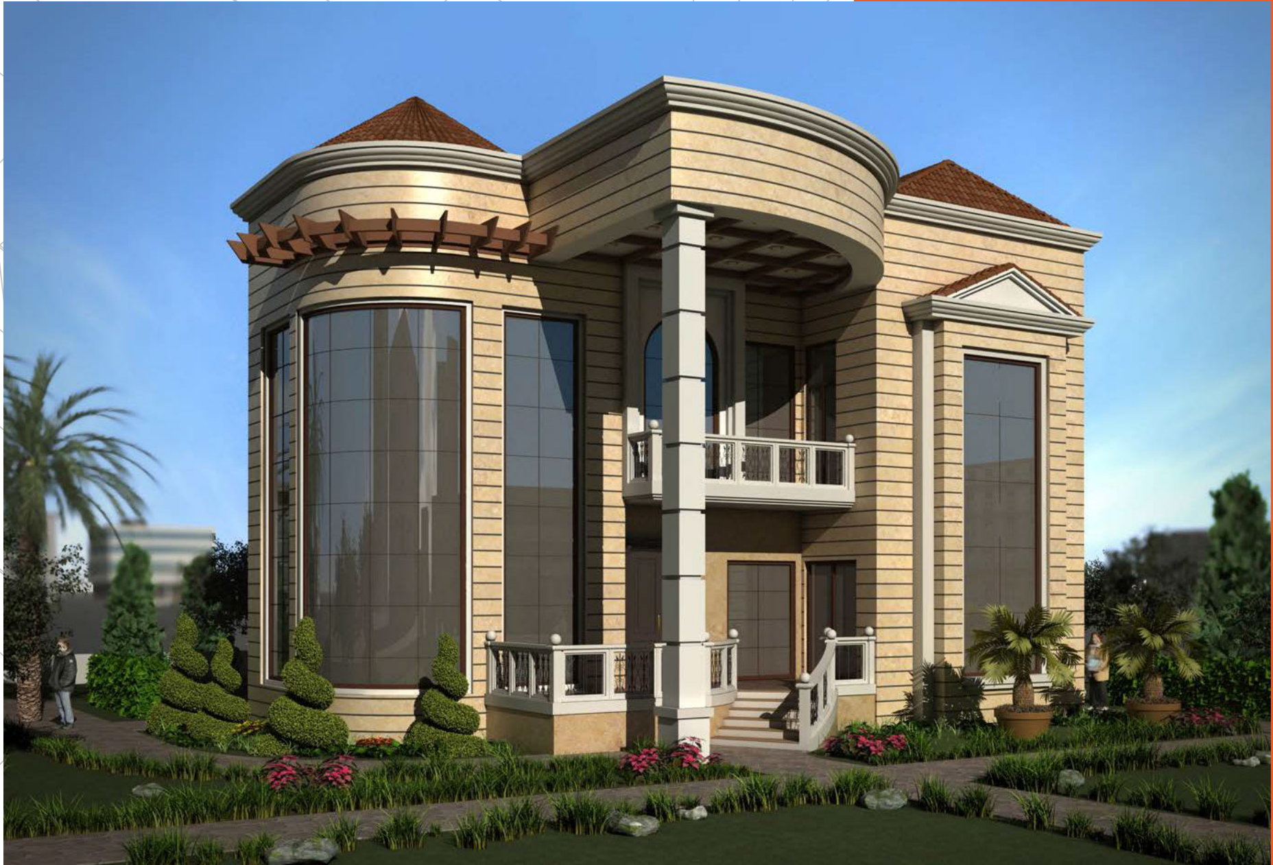
G+1 villas on plot no:355-981 at Al Quoz Second