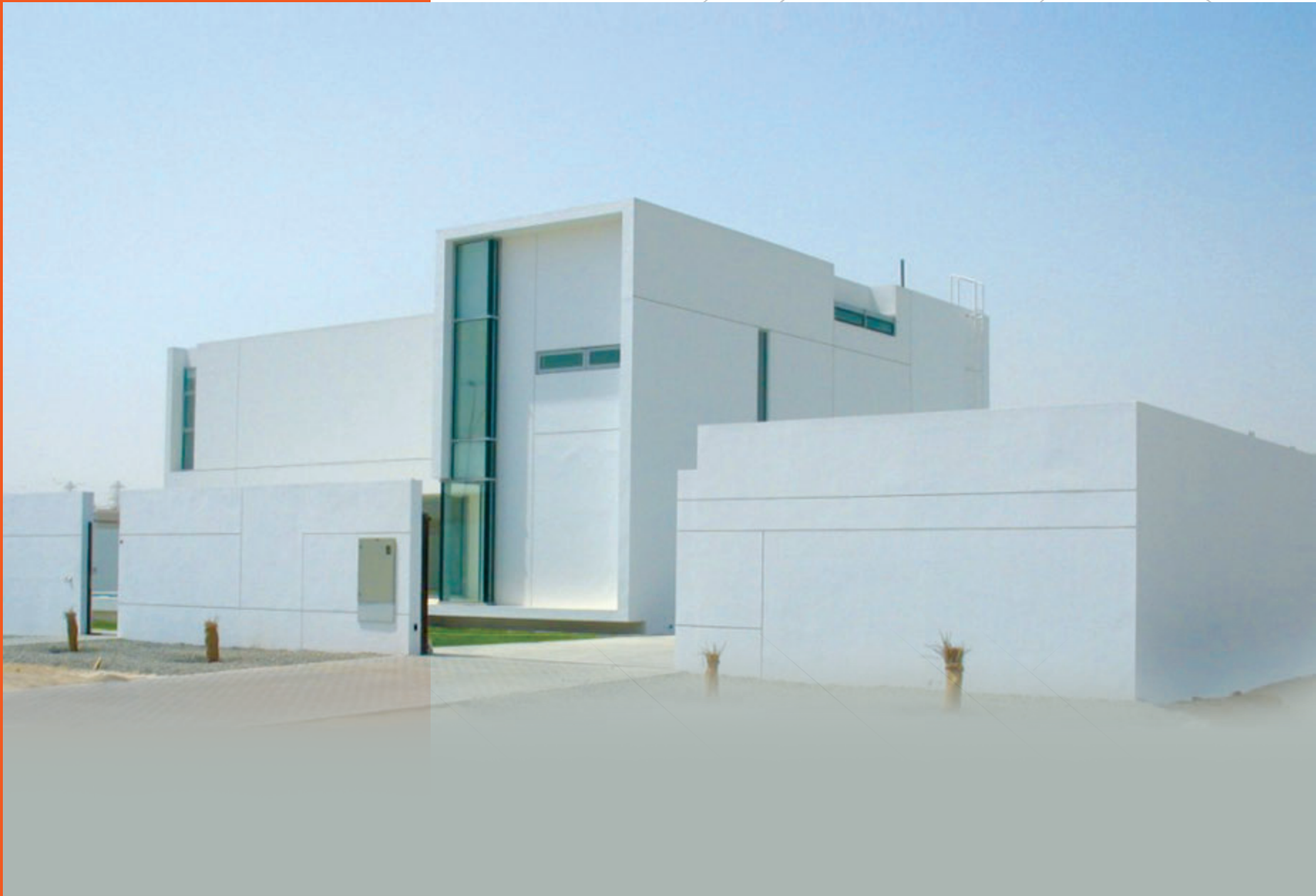
G + 1 Villa on Plot No. 376 -1568 at Al Barsha 2nd