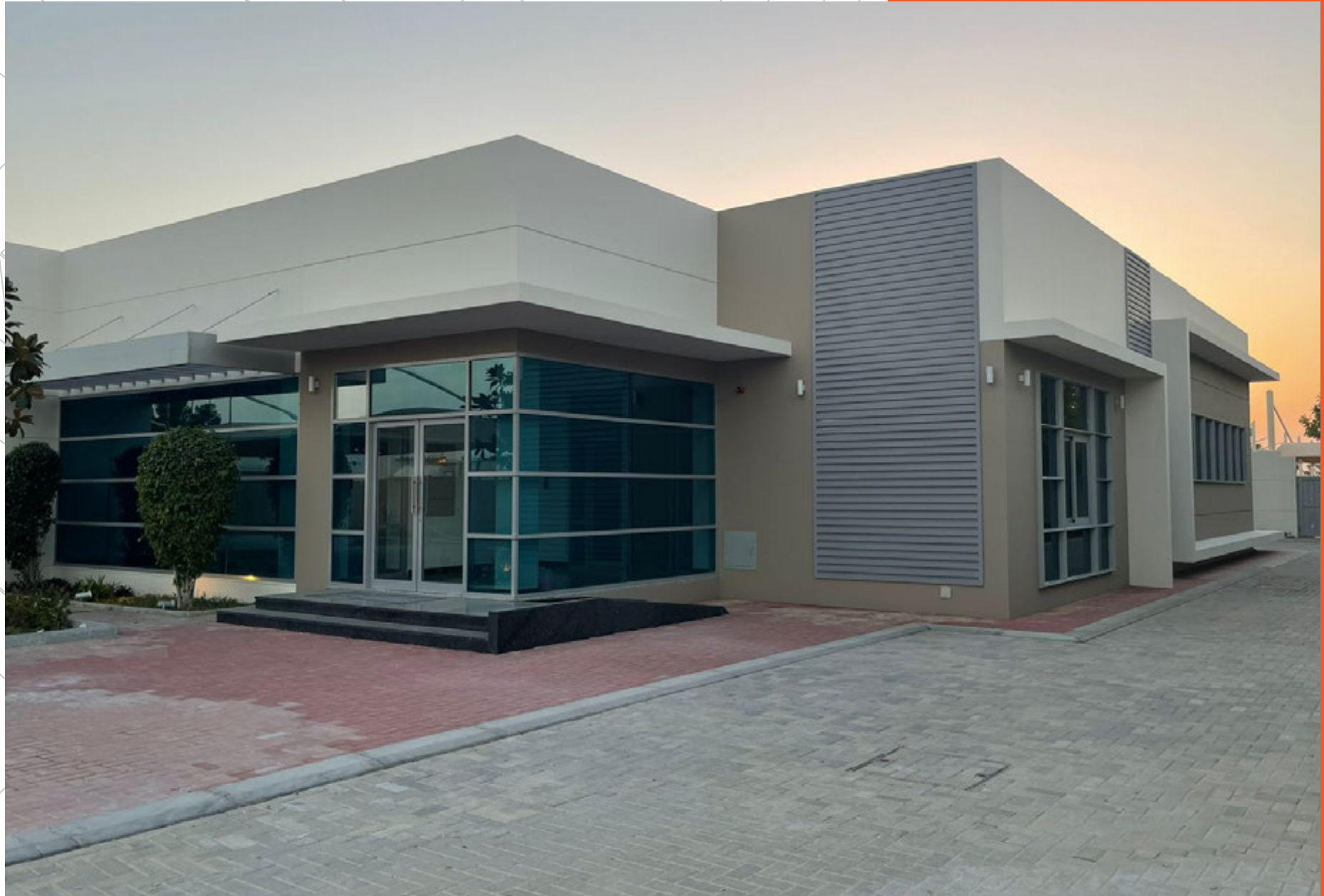
Camel Forensic Lab Extension at Lisilli M-000421000, Plot No. 9170115, Dubai (UAE)