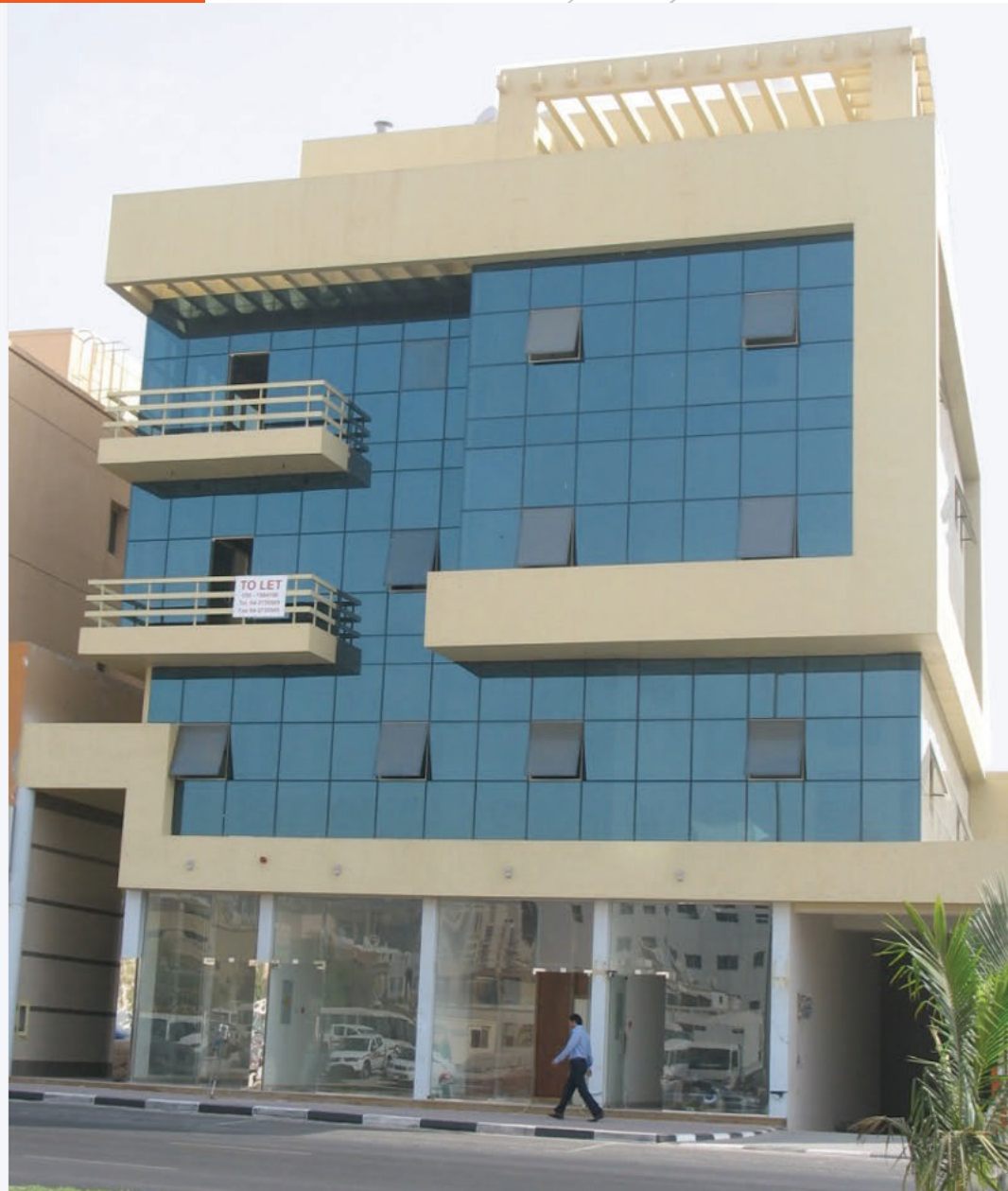
B+G+M+2+Roof Plot No.128-590 Al Khabaisi