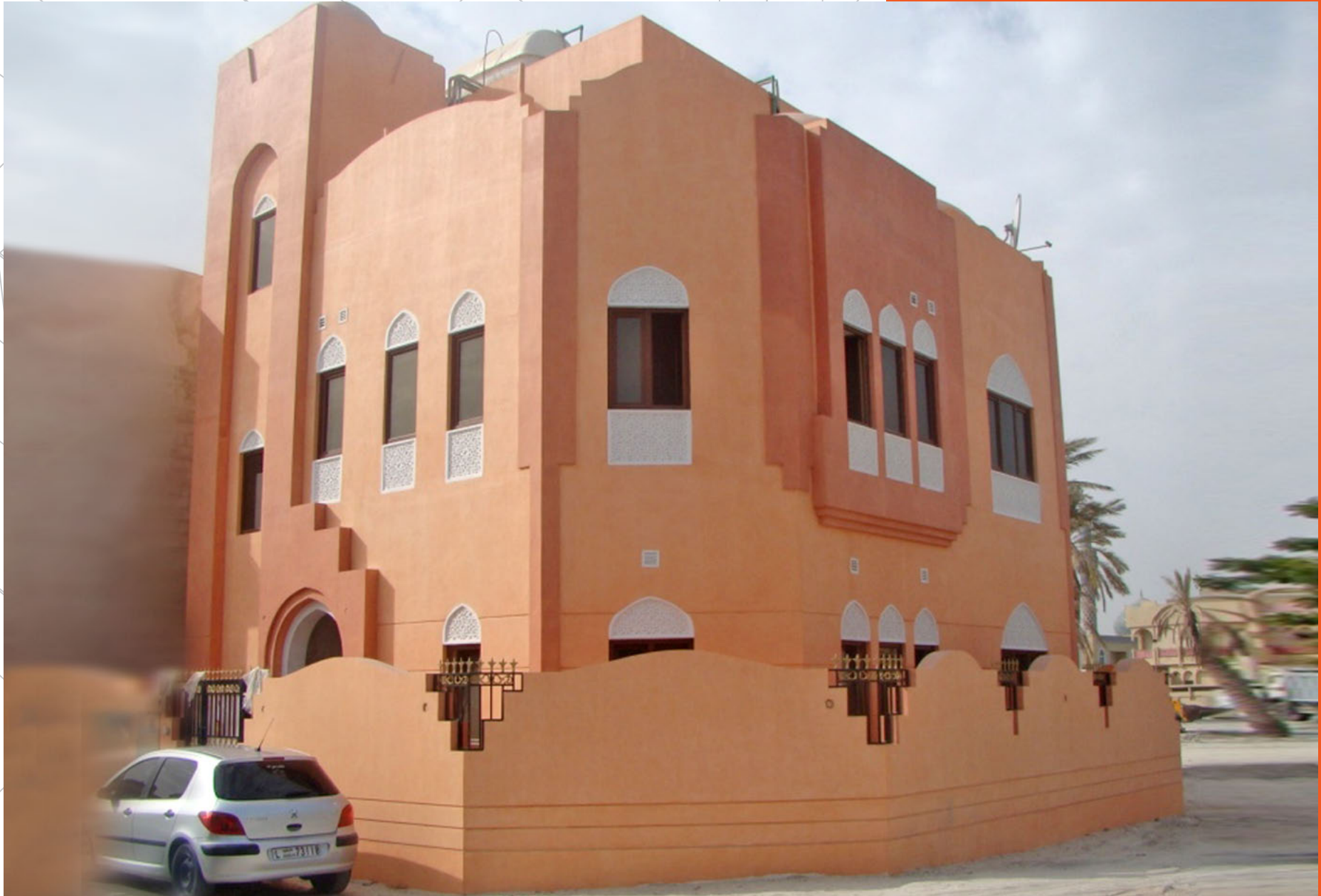
B+ G + 1 Villa Plot No. 332 -1480 Jumeriah First