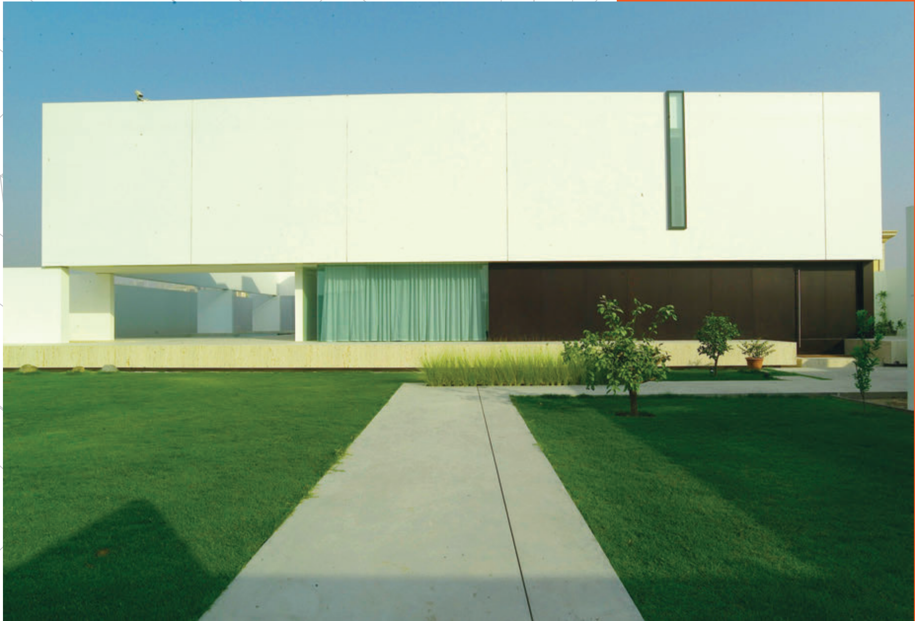
G + 1 villa on Plot No. 375-521 at Al Barsha 3