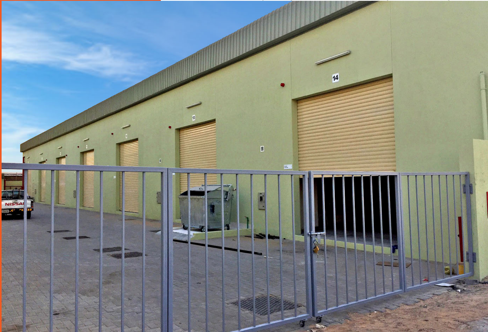
Sheds on Plot No:612-0347 at Ras Al Khor Ind.1st, Dubai