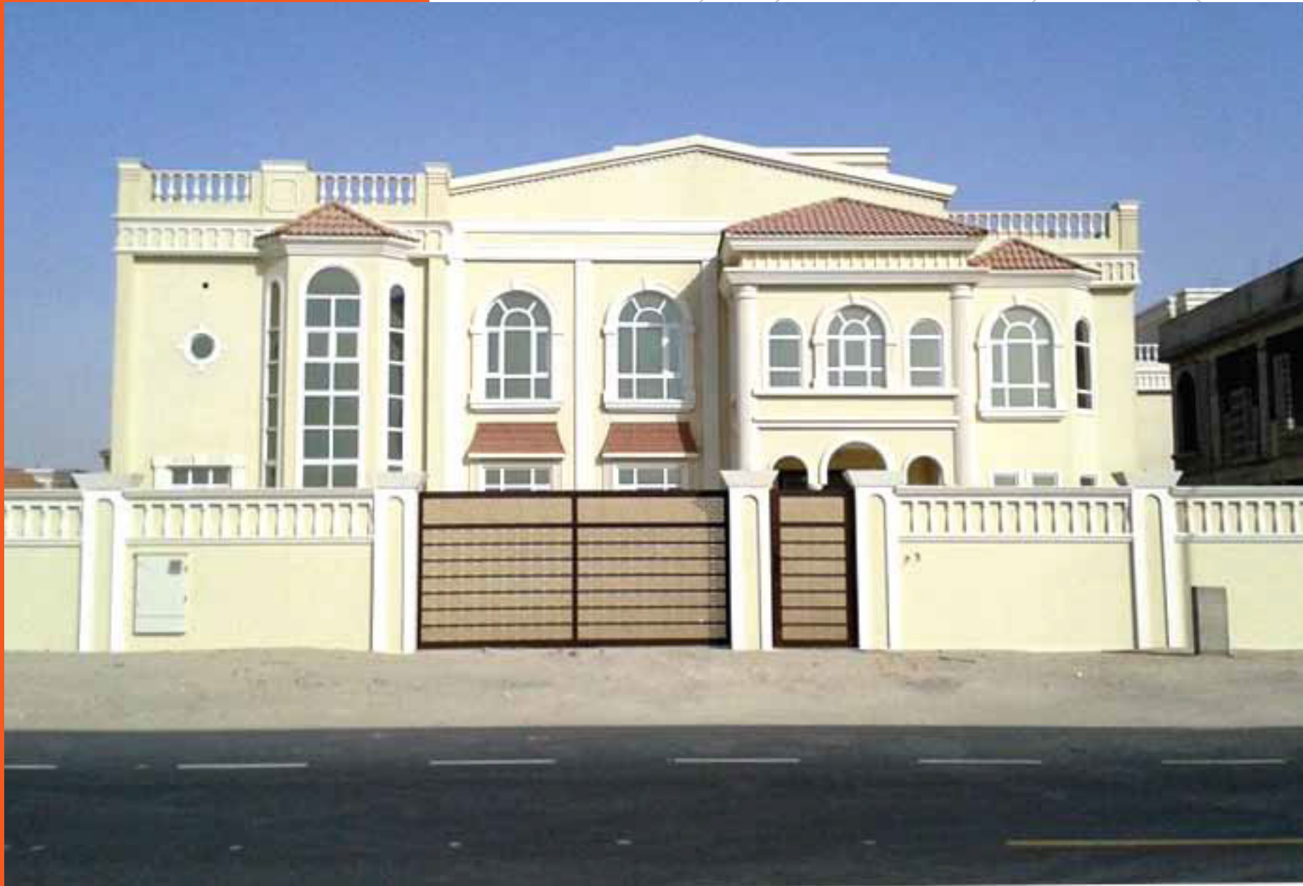
G+1 villas on plot no:671-3805 at Al Barsha South First