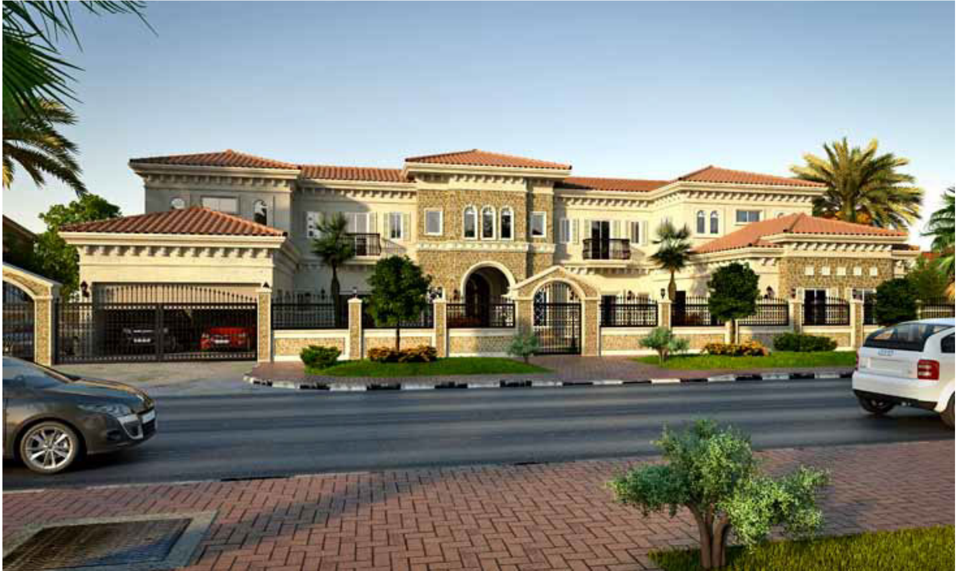
Construction of G+1 Villa on Plot No.281-1569