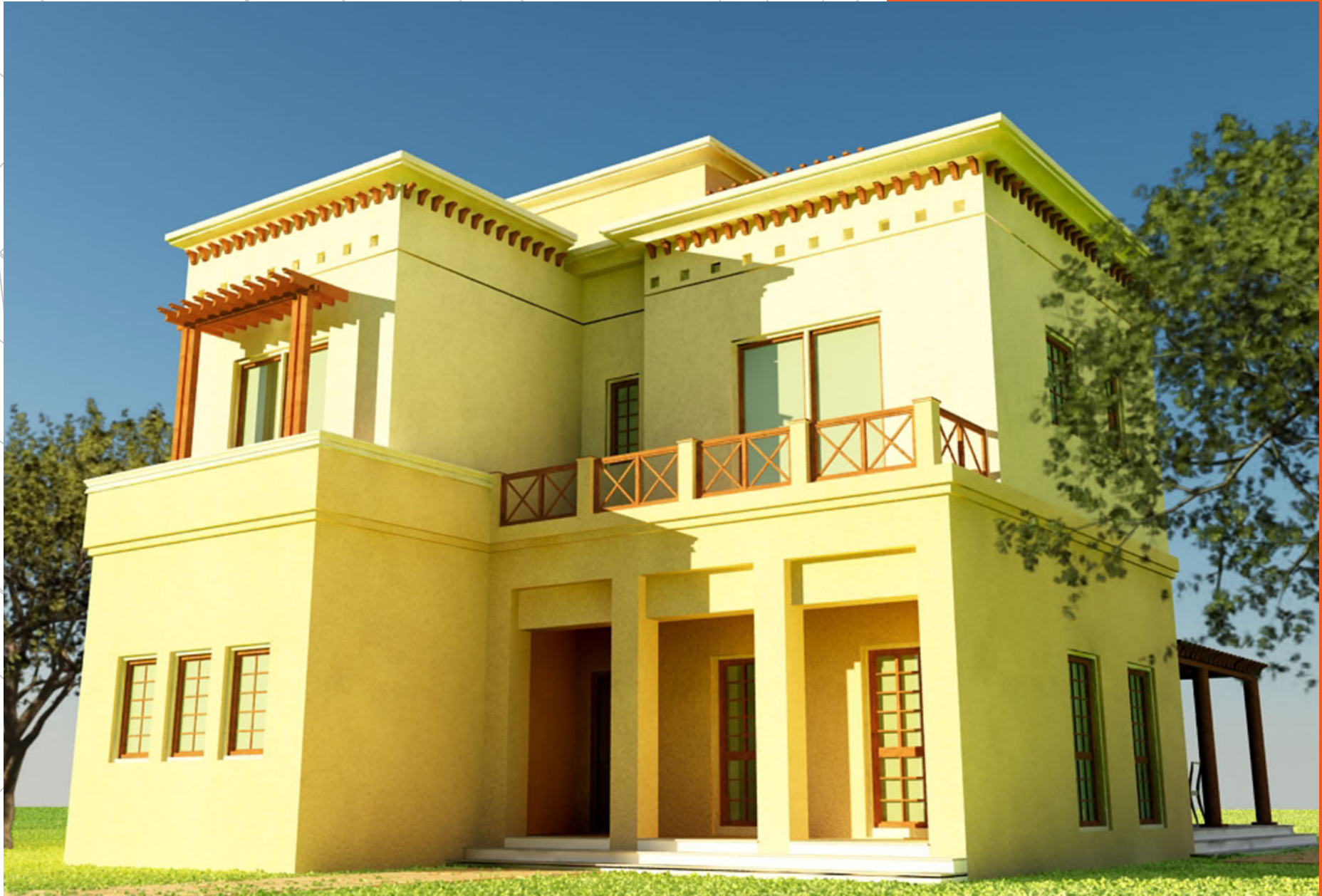
G + 1 villa on plot No. 281-2976 at Al Khwannej first