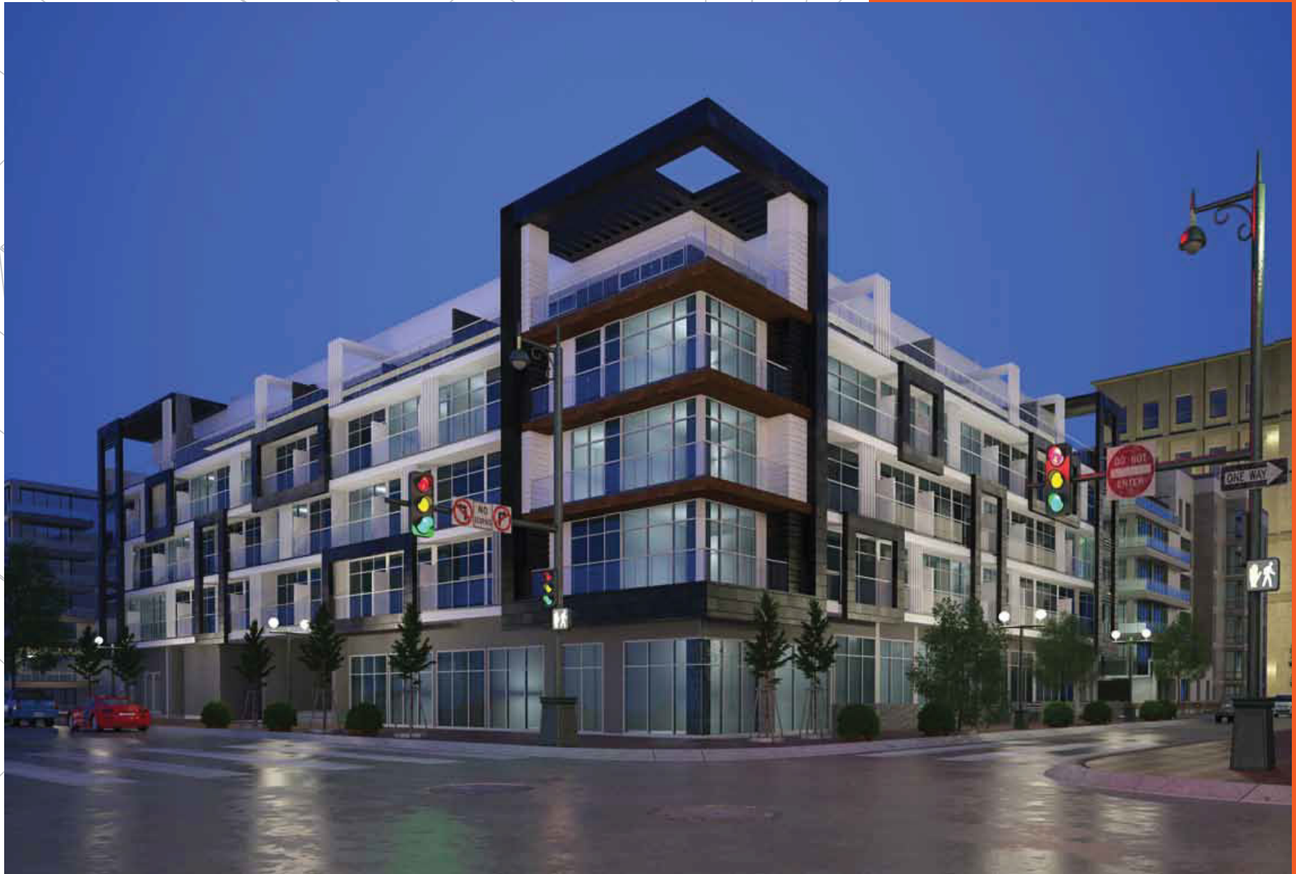
Residential building B+G+4 at JVC