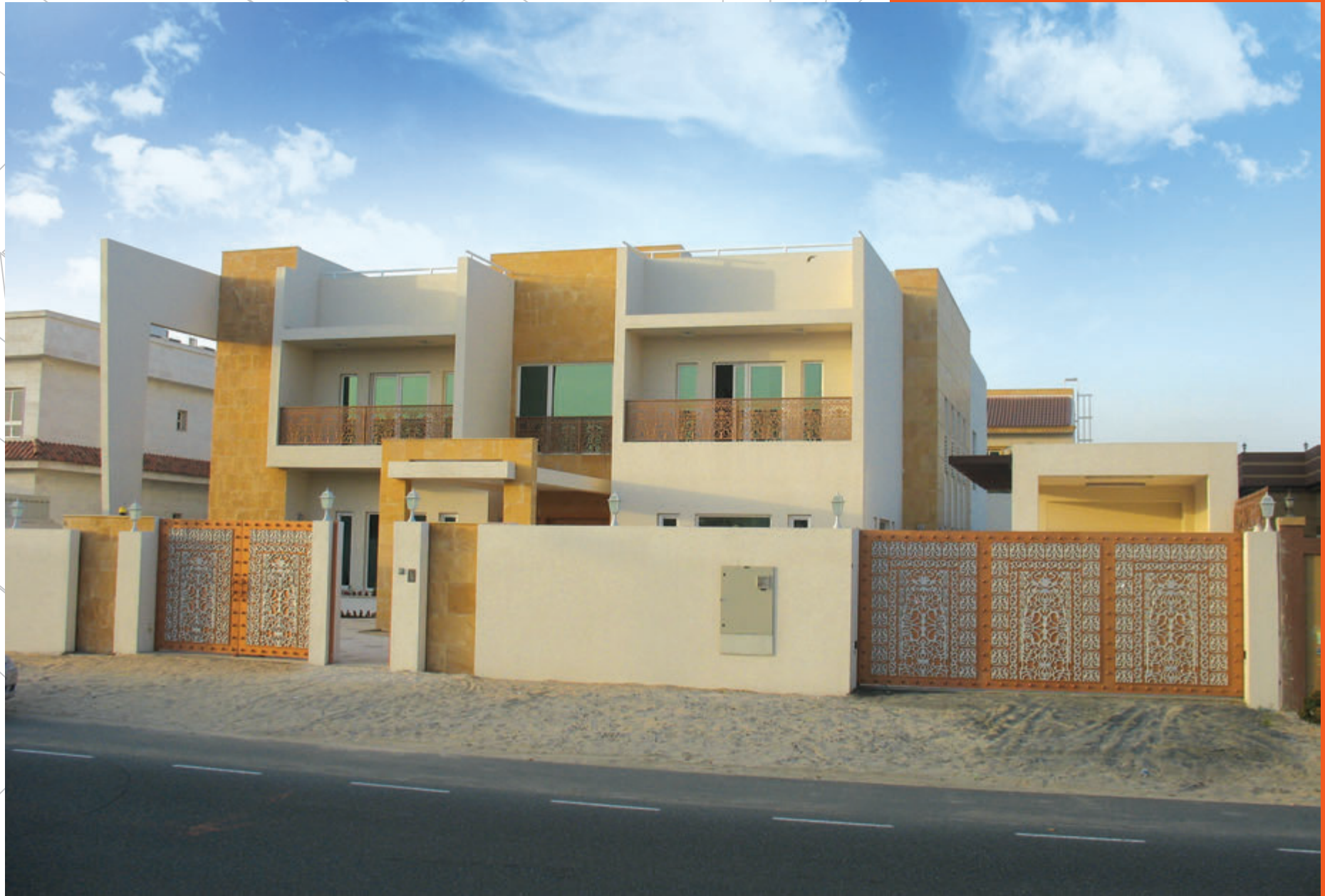
G + 1 villa on plot No. 416-1690 at Nad Al Hamar