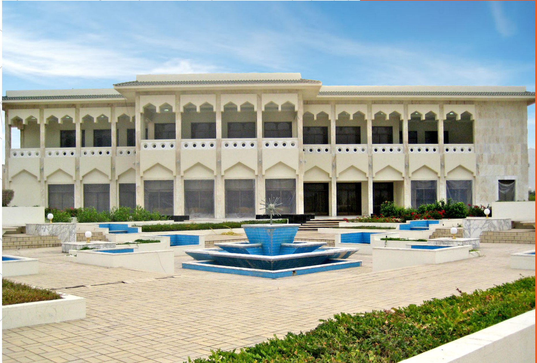
G+1 Villa on plot no. 721-232 at Al Awir second