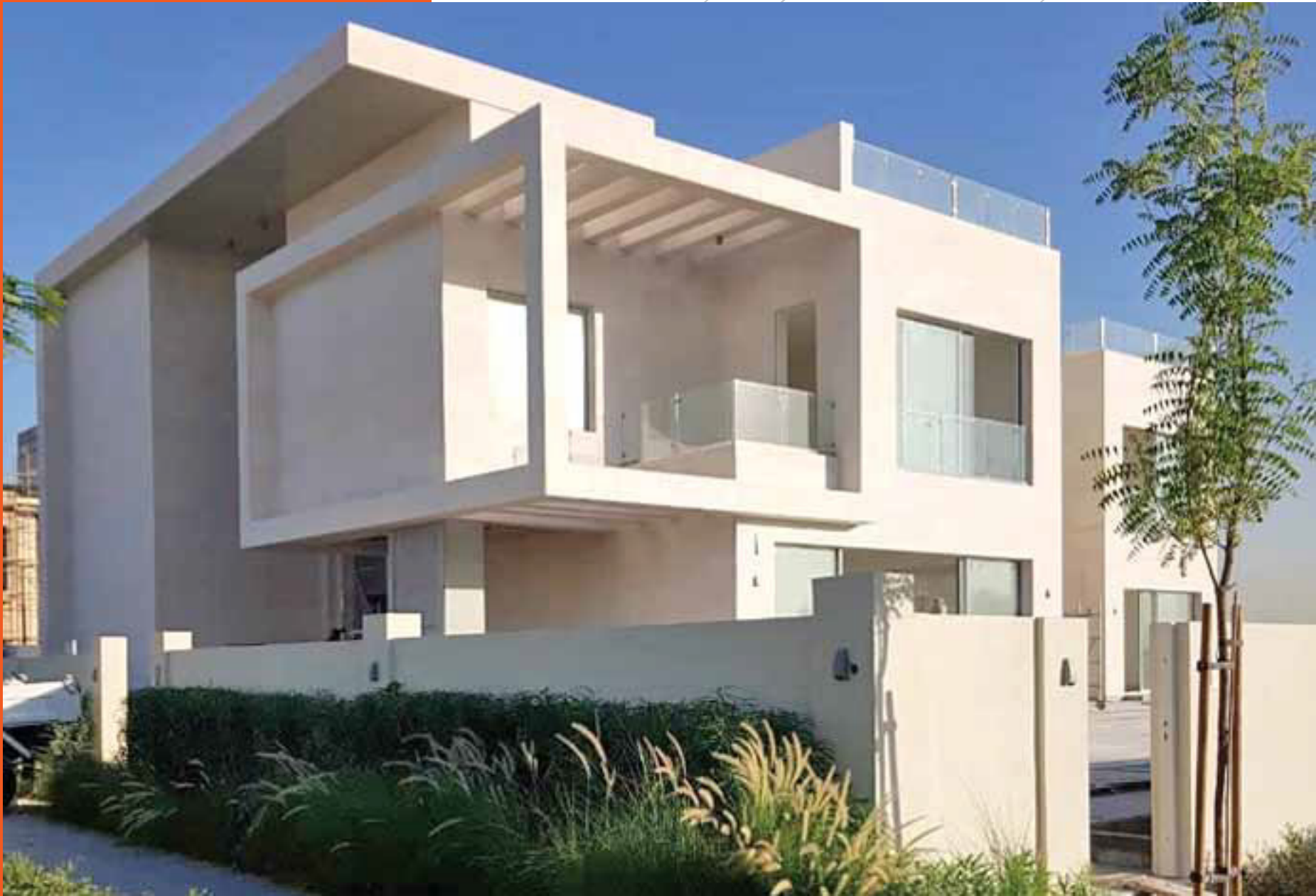
BG+1+R Villa on plot No. 6316498 At Dubai Hills