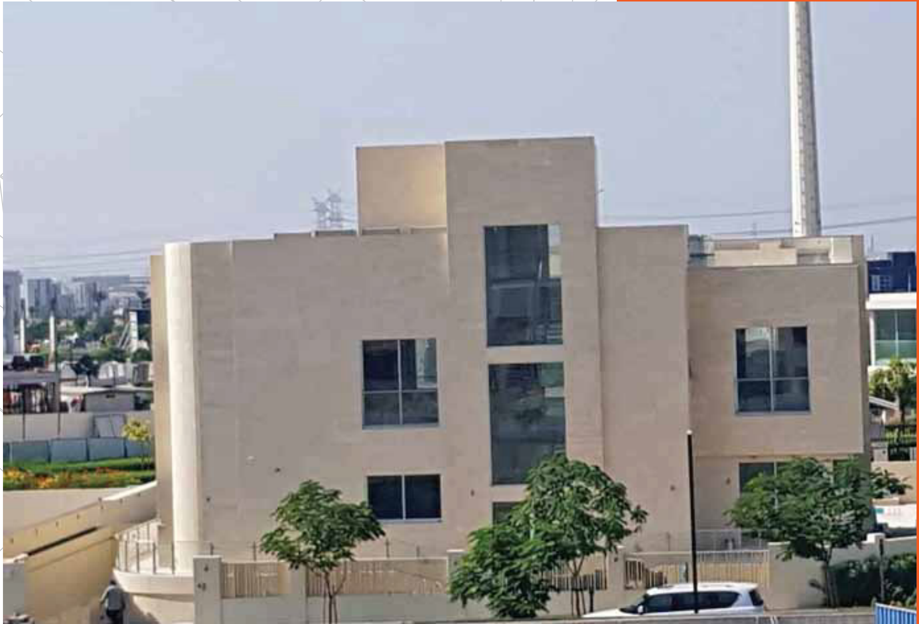
B+G+1+R Villa on plot No. 6316495 At Dubai Hills