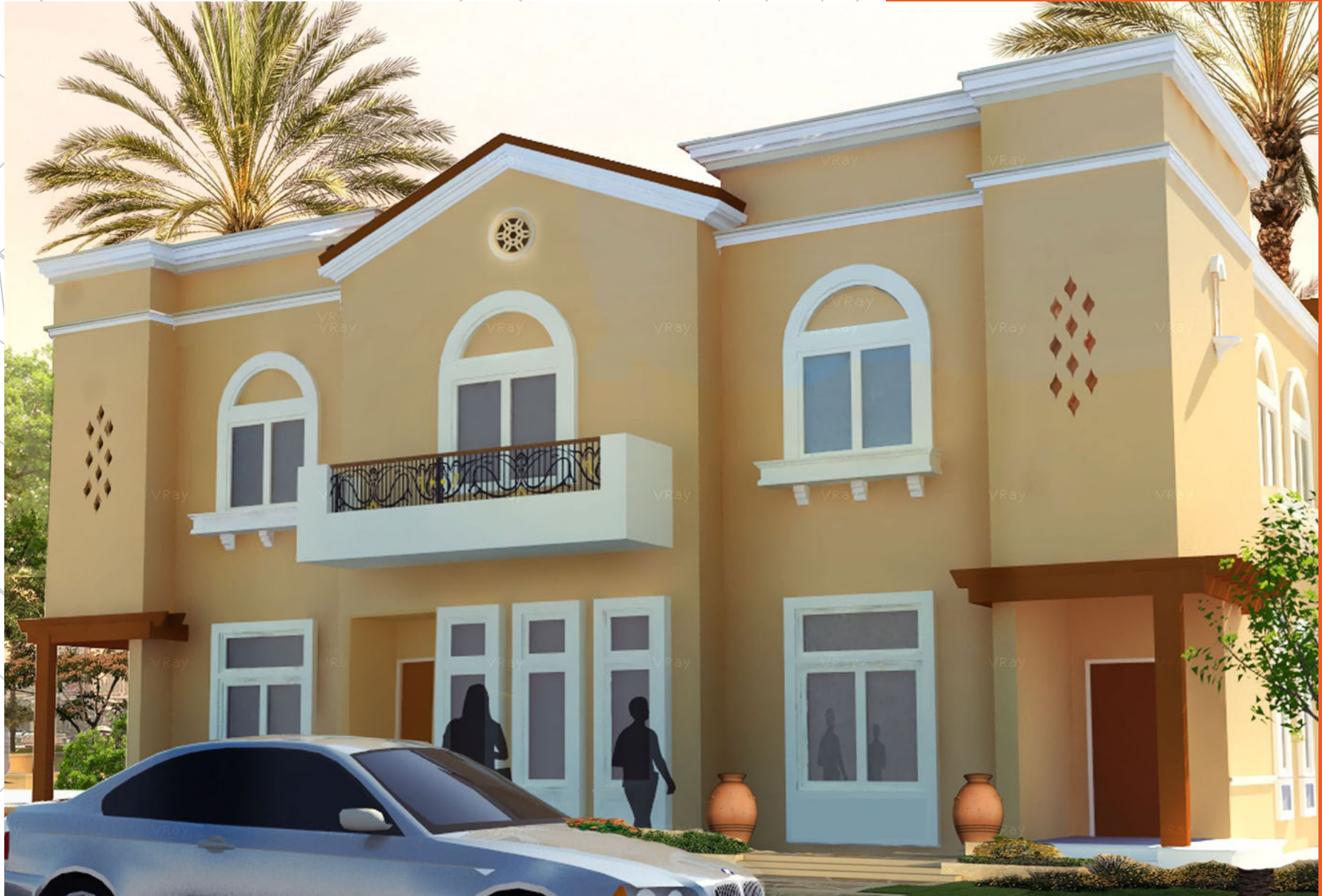
G+1 Villa (3 Nos) on Plot No: 251-1164 At Mirdif