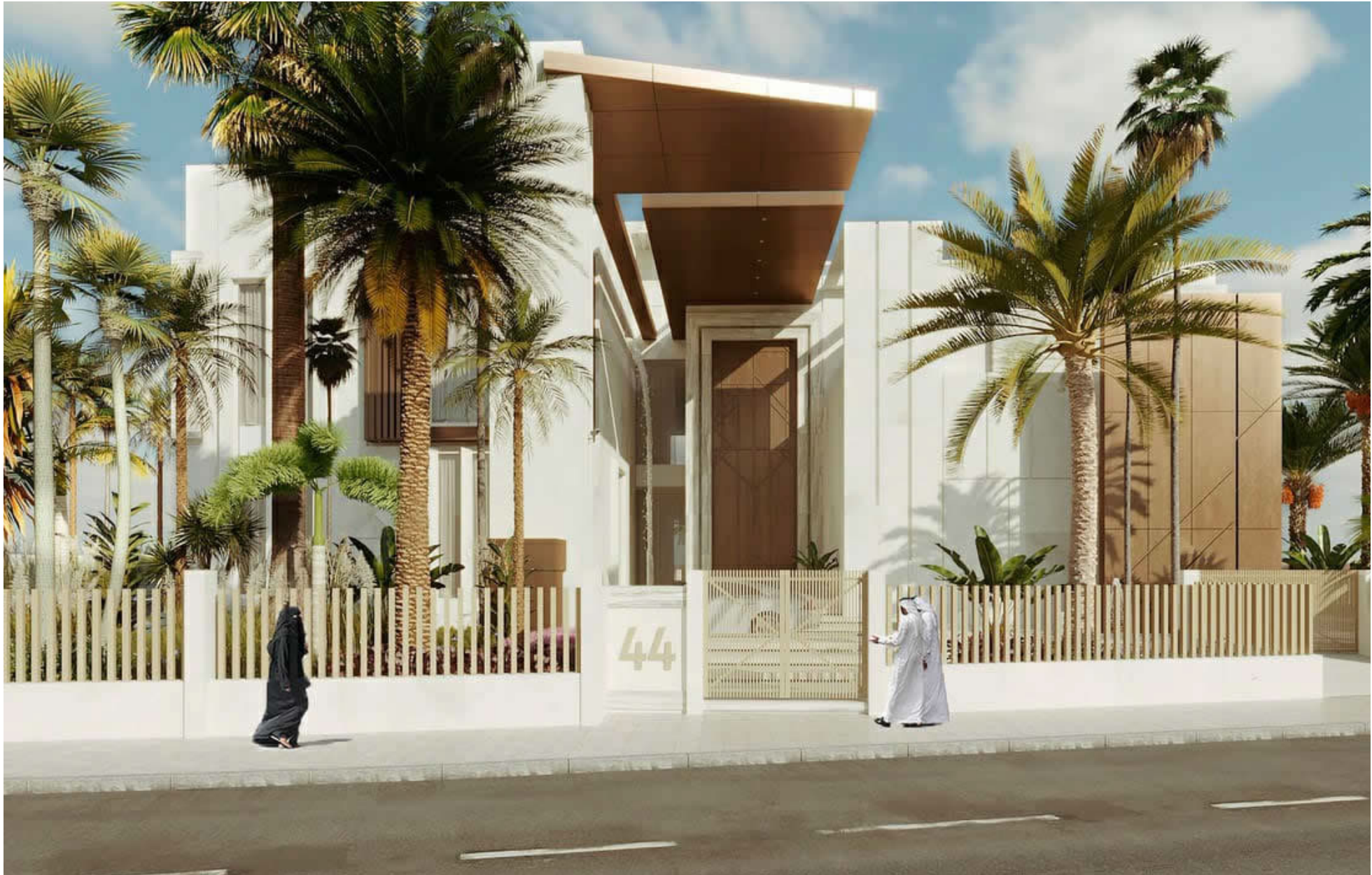
B+G+1+R Villa for Younata Investment Limited on plot No. 631-4211 (P 44), Dubai Hills, Dubai, UAE