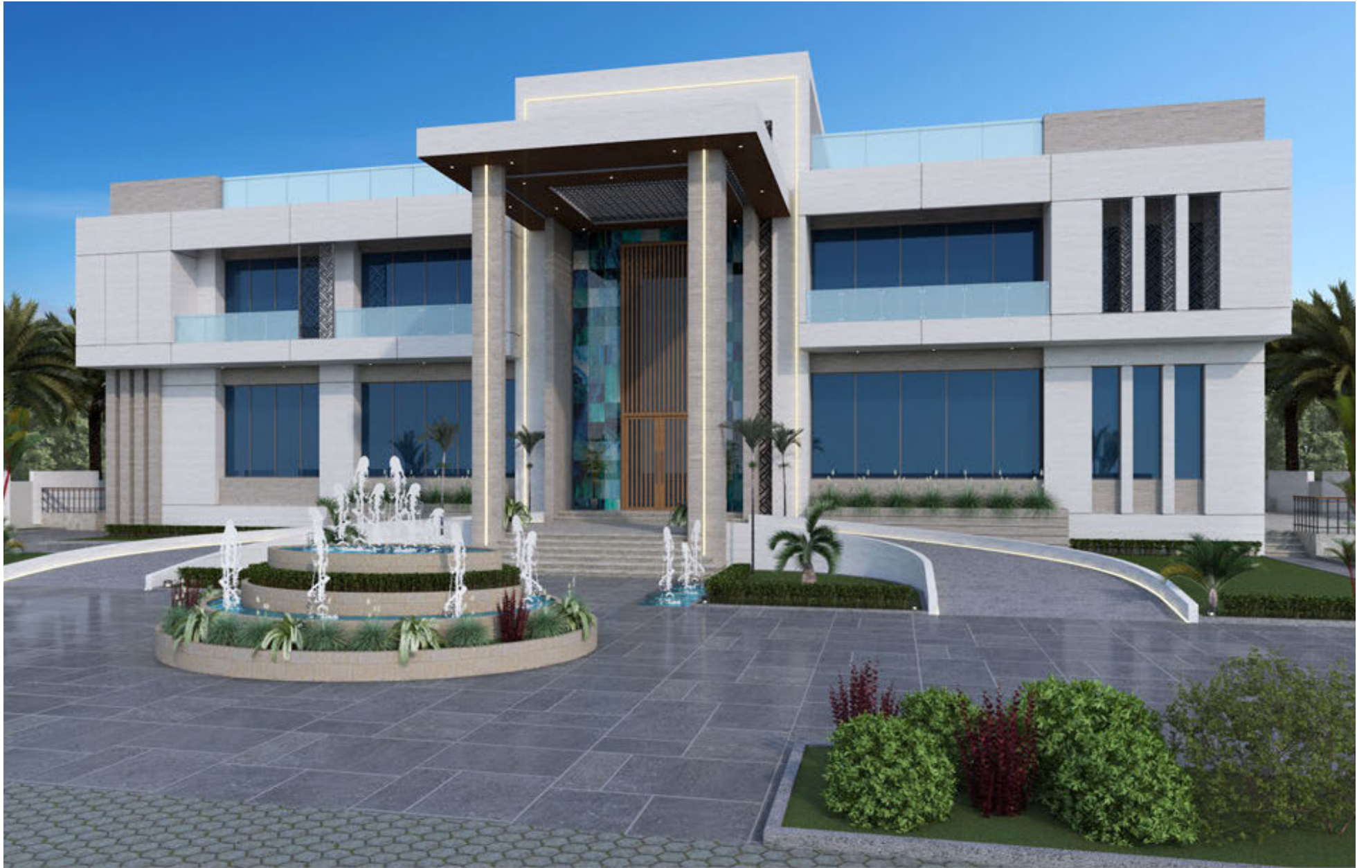
Completion work of villa (B+G+1+R) on Plot No: - 3940541