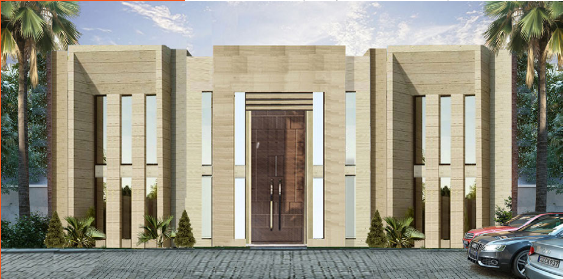
G+1+R Alta Derma Clinic at Jumeriah 2nd, Dubai.