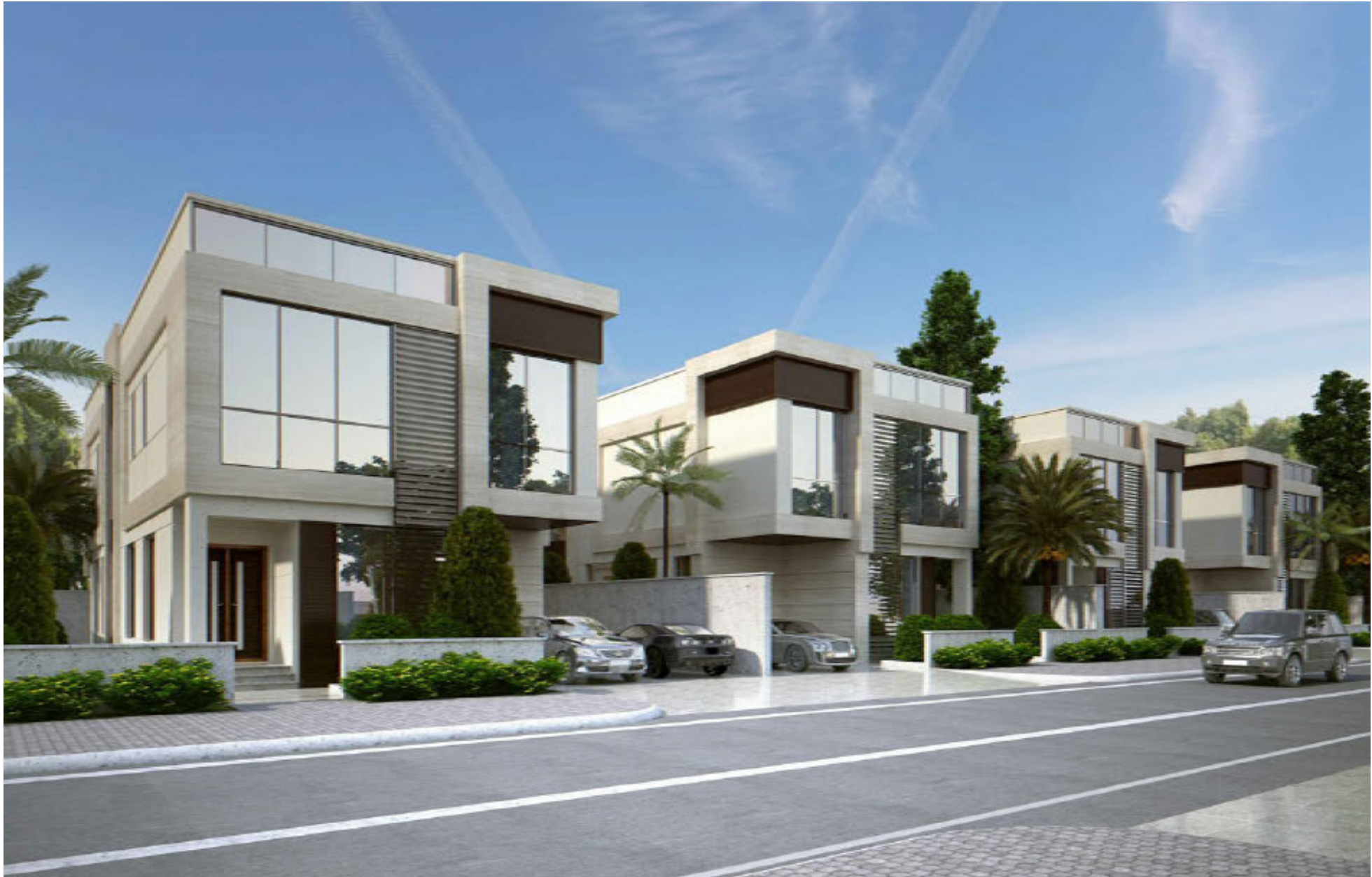
Construction of (G+1) Private Villa (6 Units) on Plot No: - 3579956