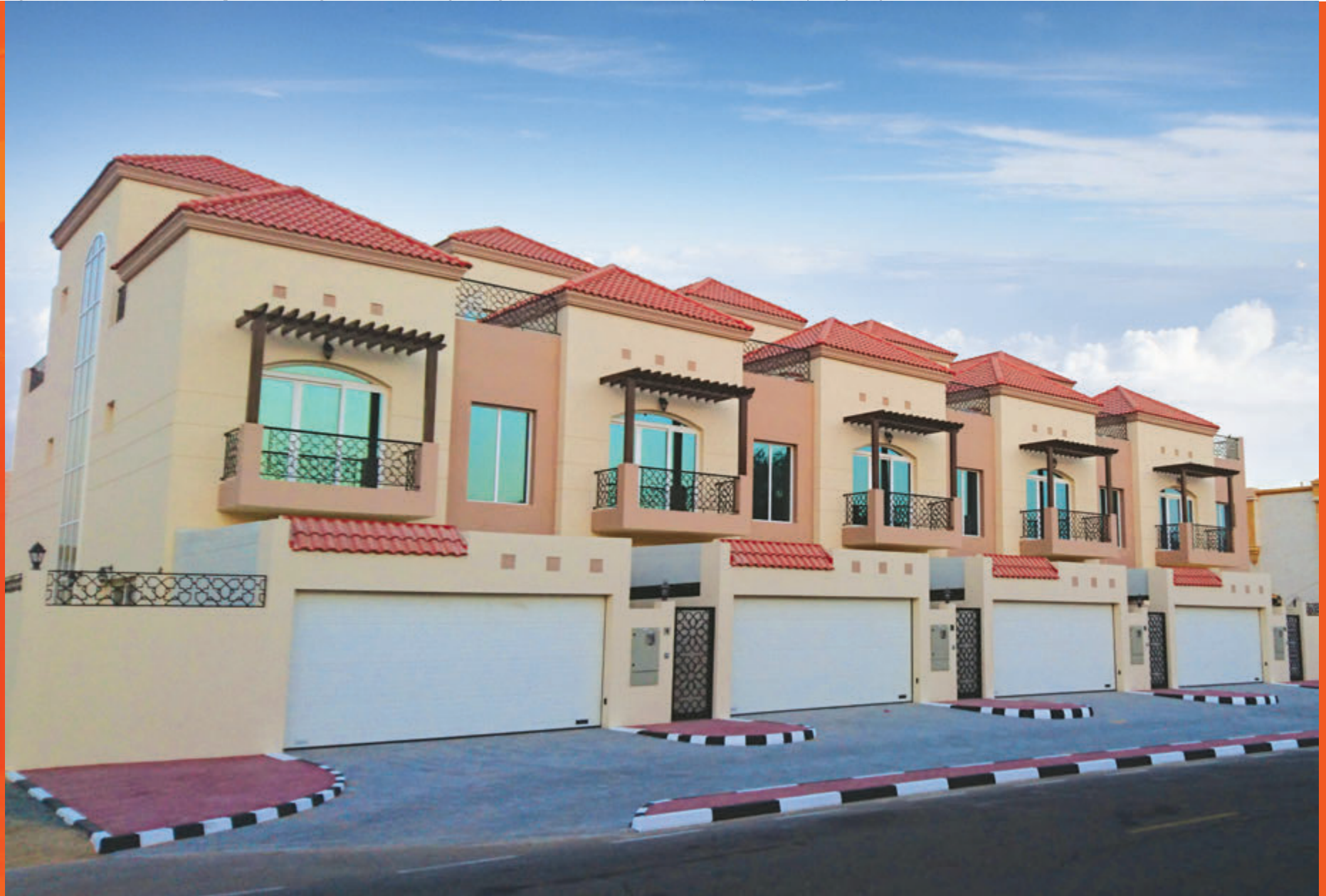
G+2 villas ( 5 nos) at Mirdif