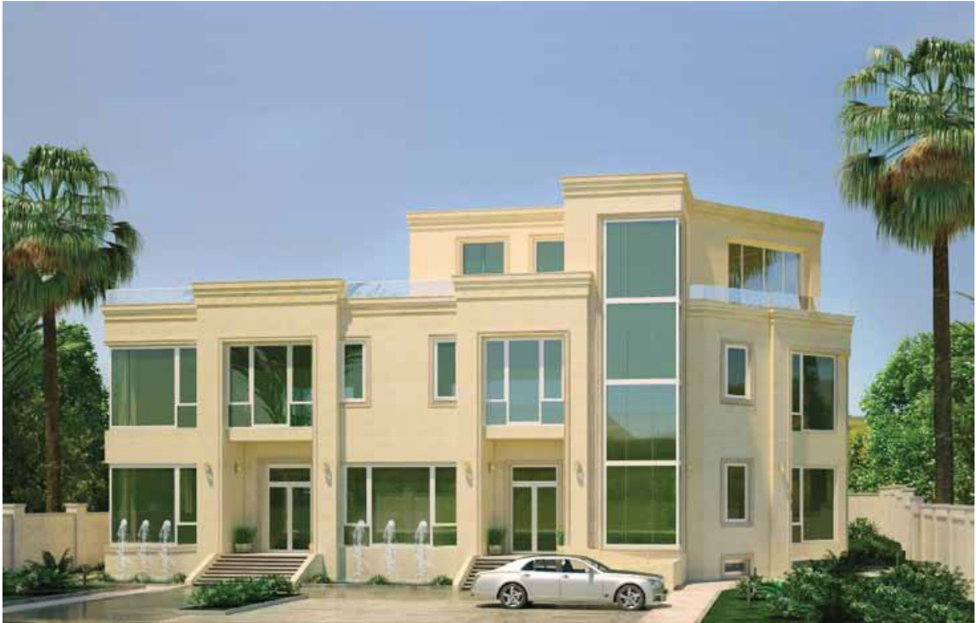
Construction of (B+G+1+R) Villa, Service Block & Majlis Block on Plot No: - 6173435