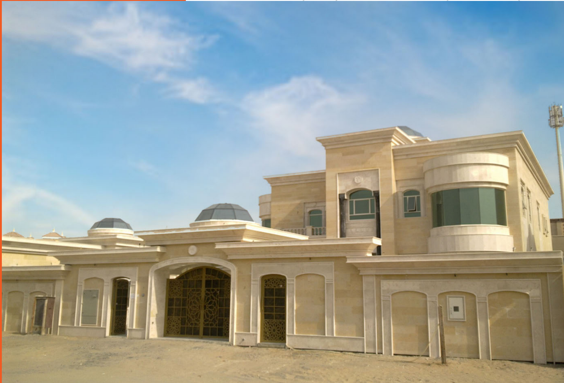
G+1 Villa on plot no. 281-2235 at Al Khwaneej 1st