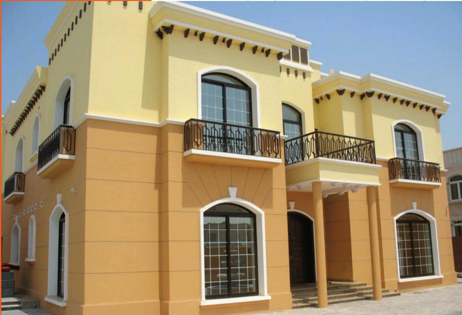
G+1 Villa on plot No. 375-1812 at Al Barsha 3rd