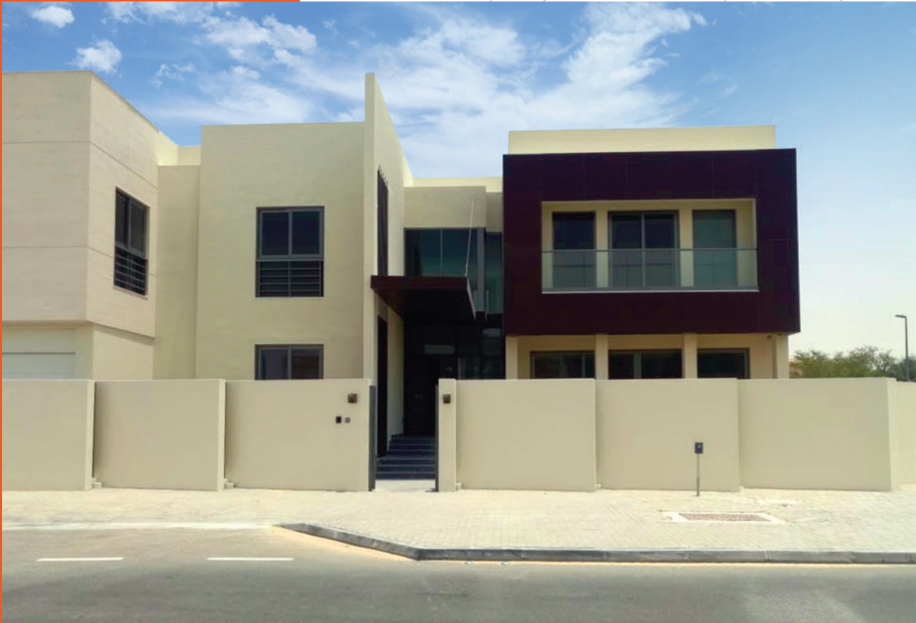
G+1+ Villa on plot No. 422-1146 At Al Warqaa Second