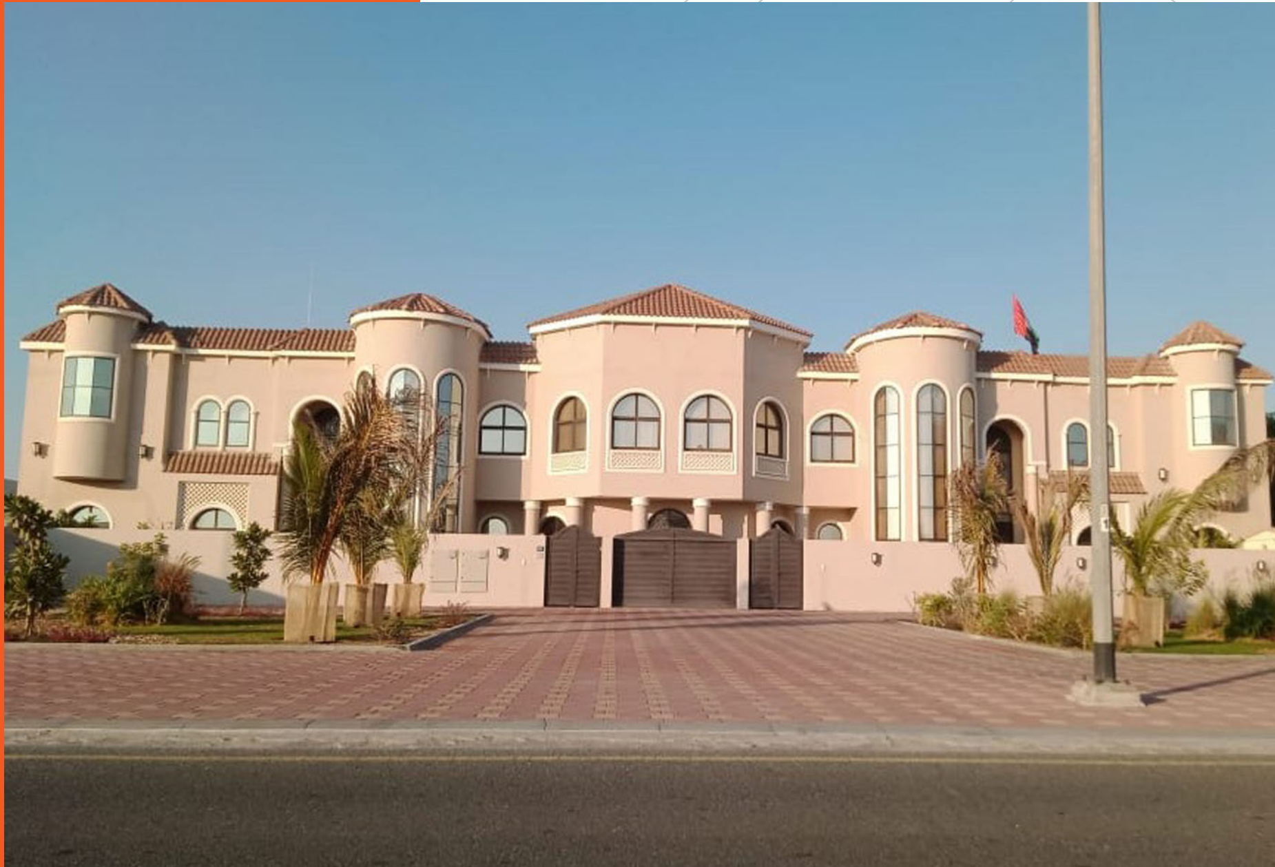
G+1 Villa on Plot No. 281 1209 at Al Khwaneej first