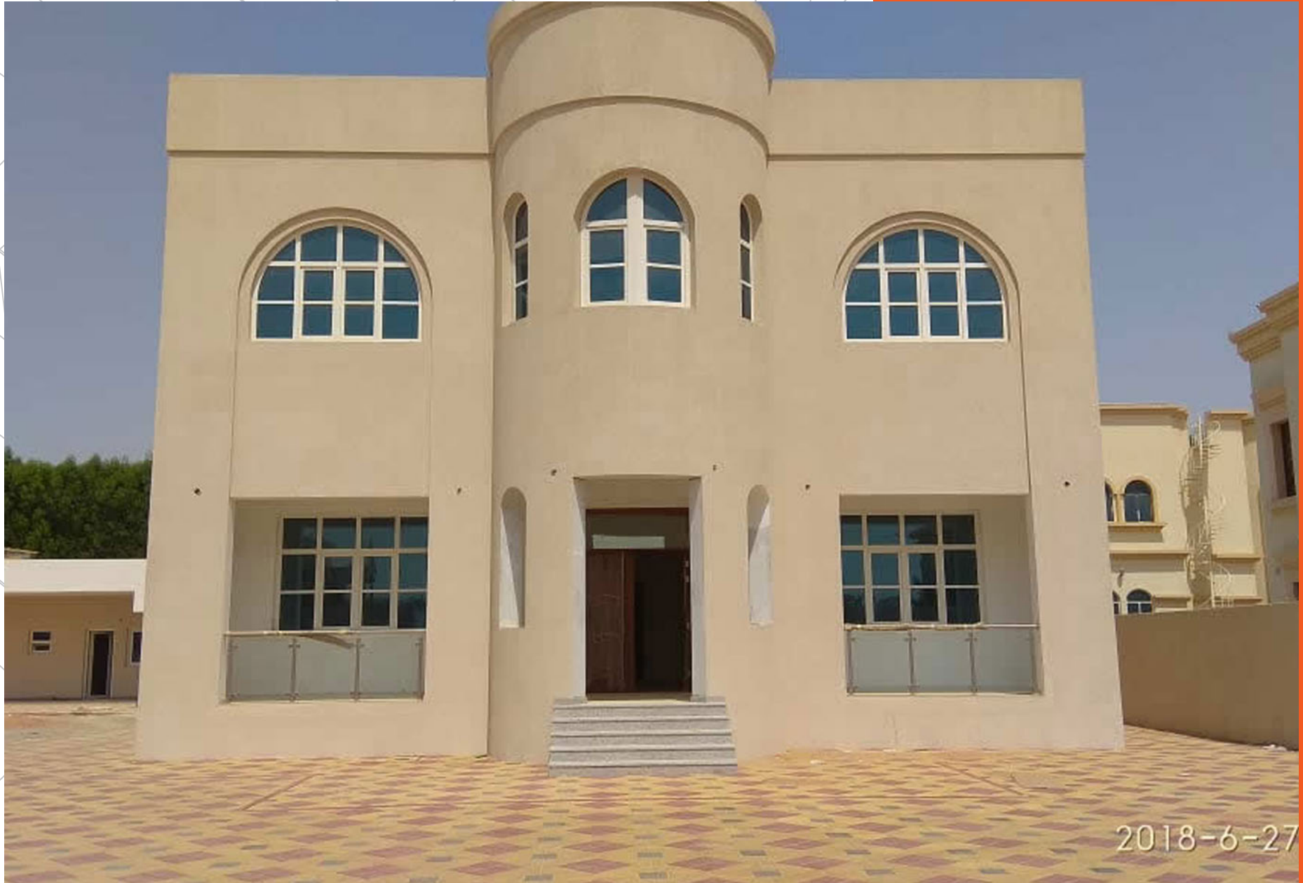
G+1 Villa on Plot No- 281-1666 at Al Khawaneej first