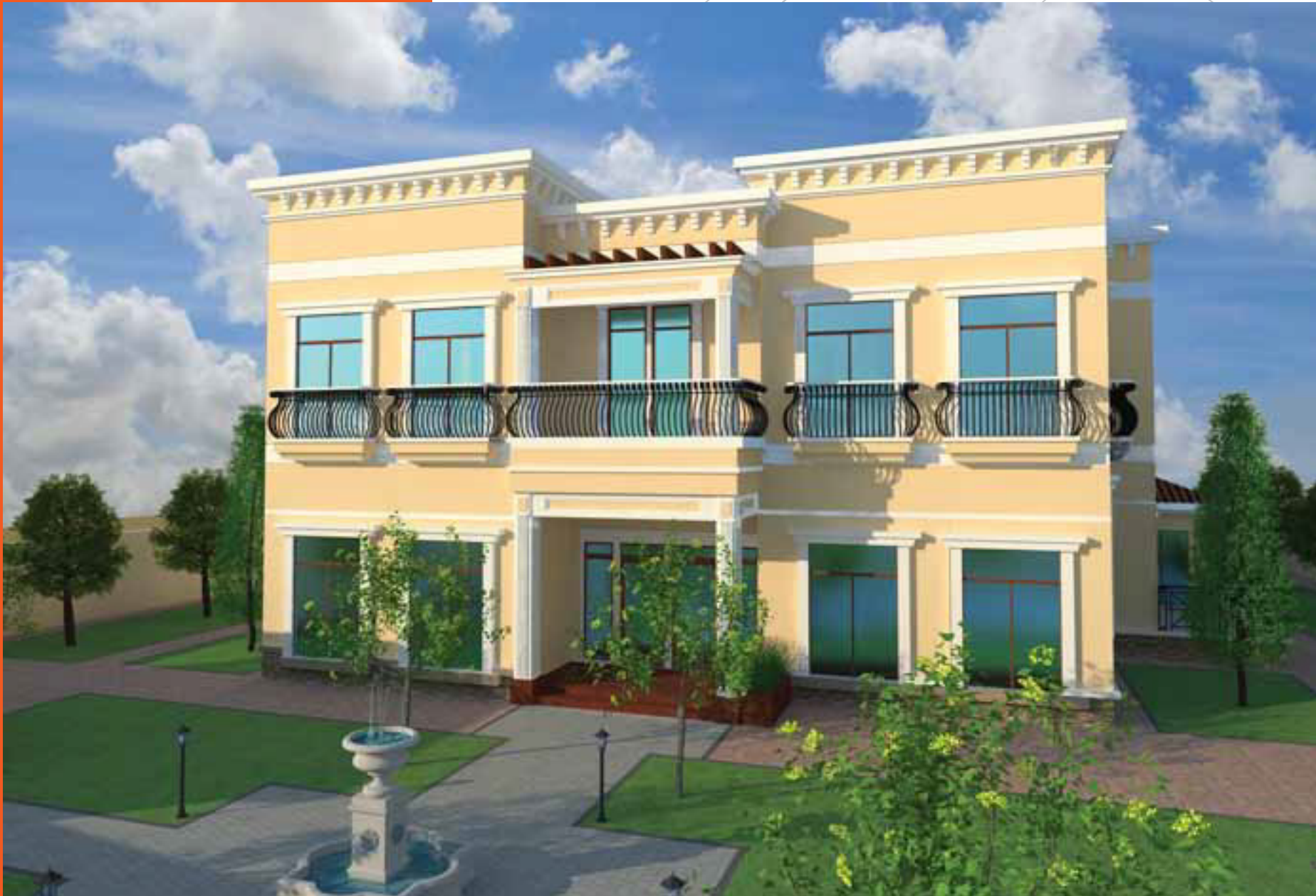
G+1 Villa (3 Nos) on Plot No: 251-1164 At Mirdif