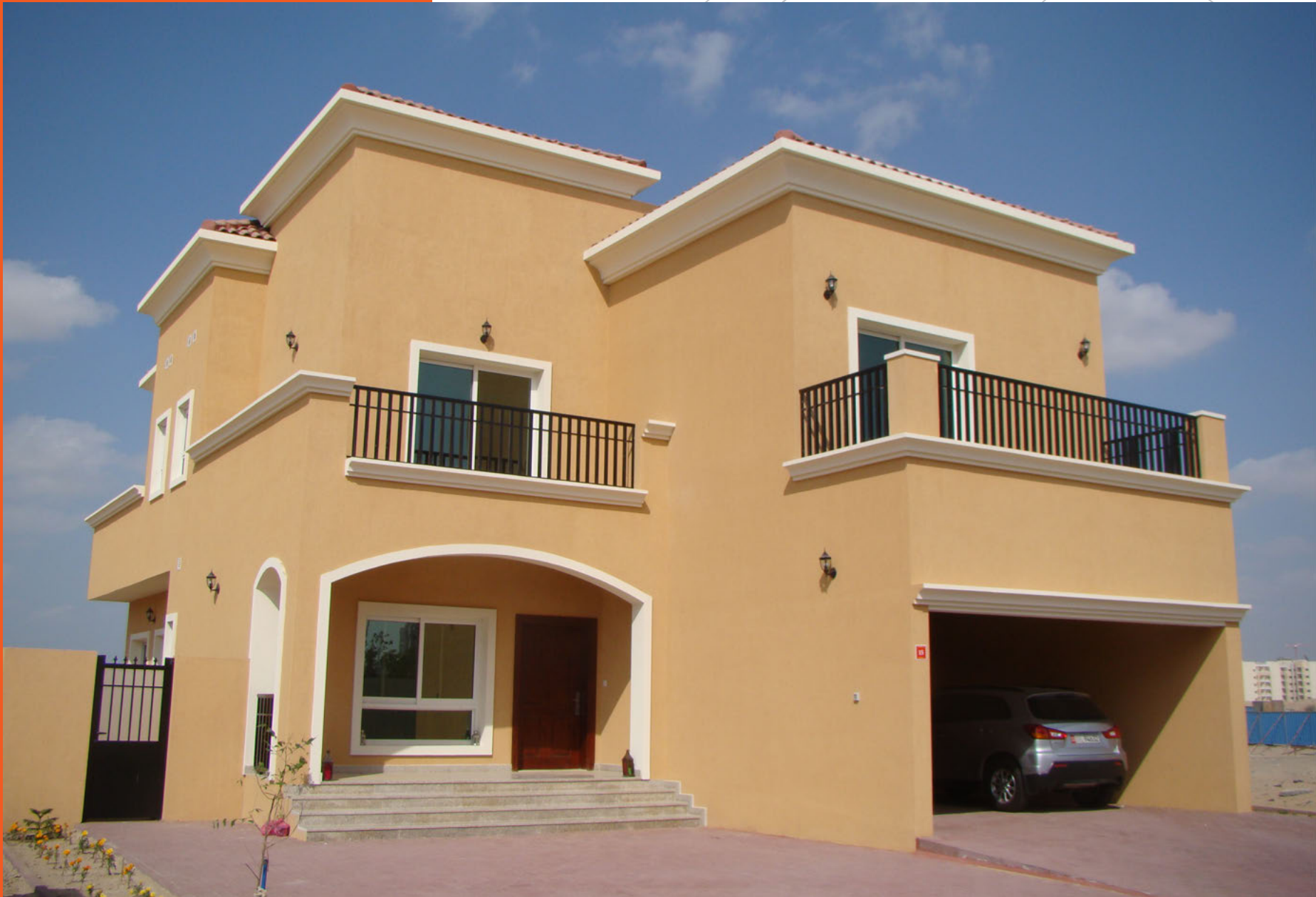
G+1 Villa on Plot No-888-3968 at Wadi Al safa south first