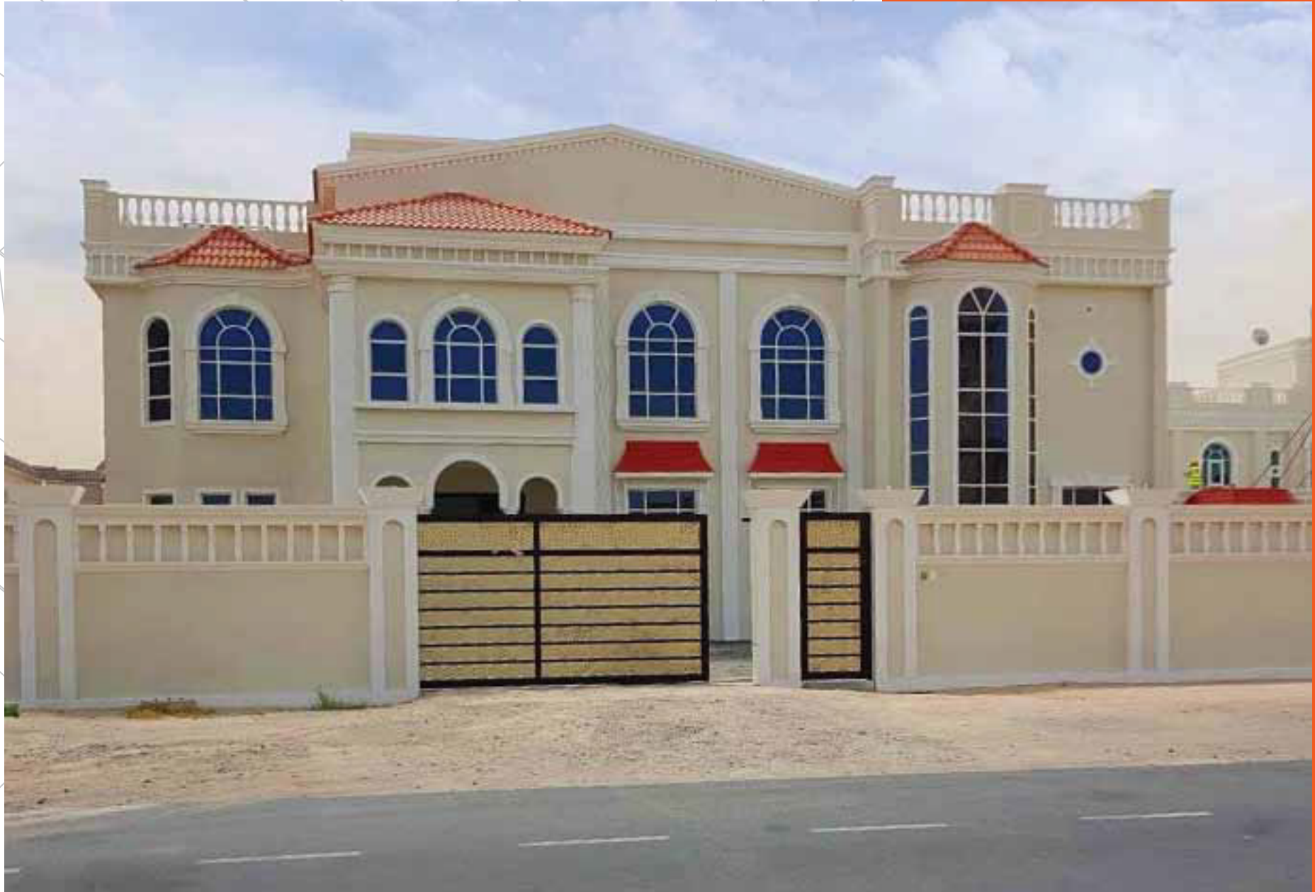
G+1 villas on plot no:671-3792 at Al Barsha South First